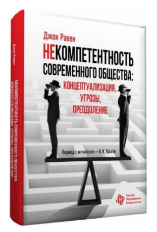
Fig. 3 – Book "Incompetence of modern society: conceptualization, threats, overcoming"

("Некомпетентность современного общества: концептуализация, угрозы, преодоление")