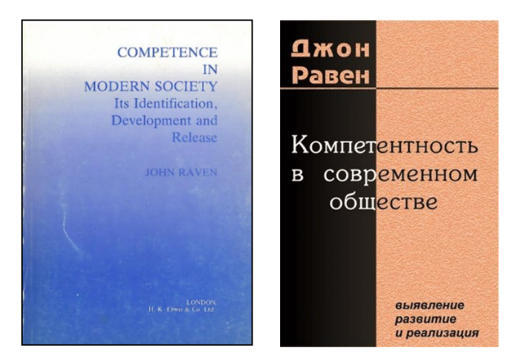
Fig. 1 – Book 'Competence in Modern Society. Its Identification, Development and Release' and its translation into Russian

«Компетентность в современном обществе: выявление, развитие и реализация» -"Competence in modern society: identification, development and realization"